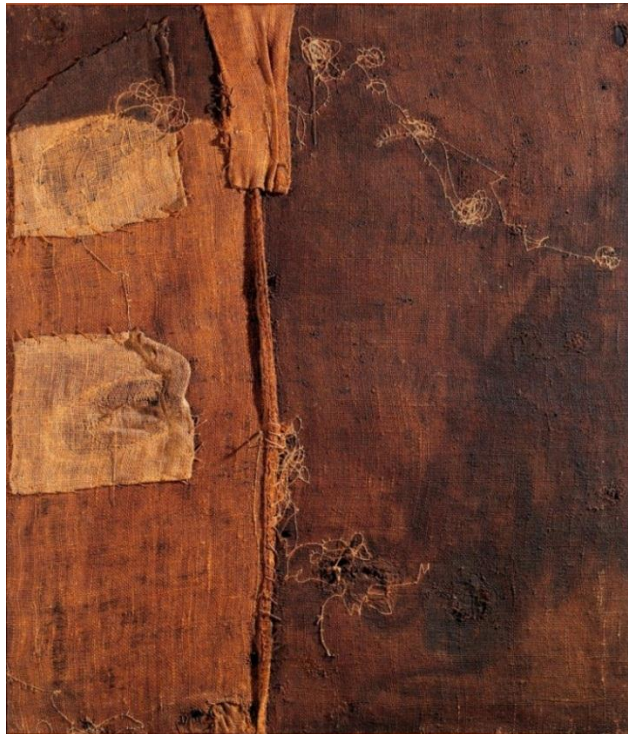
Alberto Burri, Sacco , oil and burlap on canvas Executed in 1953, estimate: £1,800,000-2,500,000

London - Christie's is pleased to present the 13 th edition of their prestigious Italian Sale, the only annual international auction dedicated to the masters of 20 th century Italian Art. It will be offered in the King Street saleroom on 18 October 2013, following the evening auction of international Post-War and Contemporary Art. This year's curated selection will feature more than 50 works created by a wide array of artists, from those belonging to the Modern movement, such as Giorgio de Chirico and Giorgio Morandi, to post-war revolutionaries including Alberto Burri and Lucio Fontana, to more recent artists, who include Alighiero Boetti, Pino Pascali and Maurizio Cattelan.