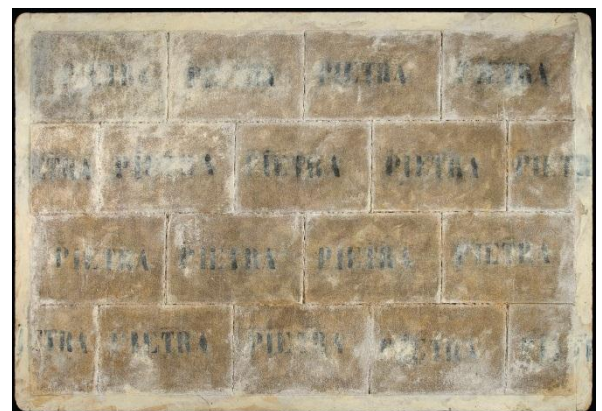
Pino Pascali, Muro di pietra (Pietra pietra) Executed in 1964, estimate: £400,000-600,000